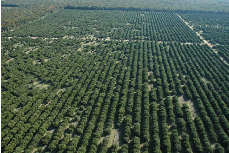
Fig. 3 – Spatial distribution of HLB affected trees. Note the aggregation of eliminated symptomatic trees at short distance and associated secondary foci of additional removed trees at short distances.